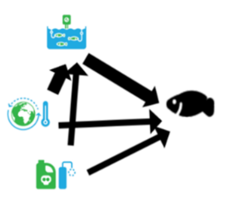
Figure 2: A mental model from a participant which shows how (from top to bottom) fishing in breeding grounds, climate change and destructive fishing gear affect the fish stock.